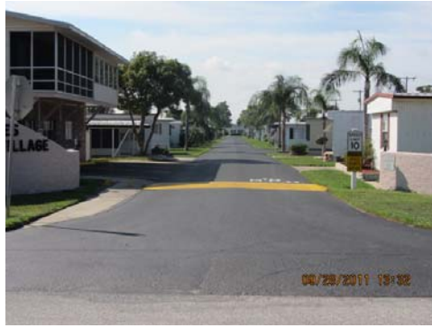
Entrance to the park with its new speed hump and sealed roads.