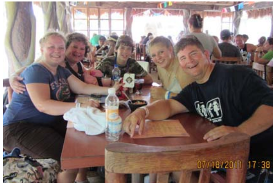
Family in Cozumel